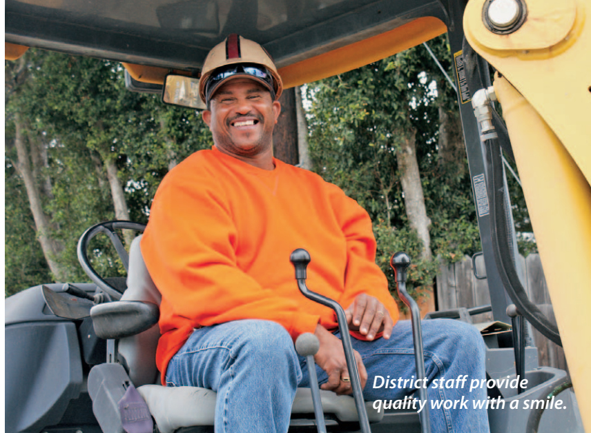
District staff provide quality work with a smile.

Water system improvements create long-term value for customers by decreasing the number of pipeline breaks and shutdowns, which lowers maintenance and repair costs, while improving reliability of the entire system.