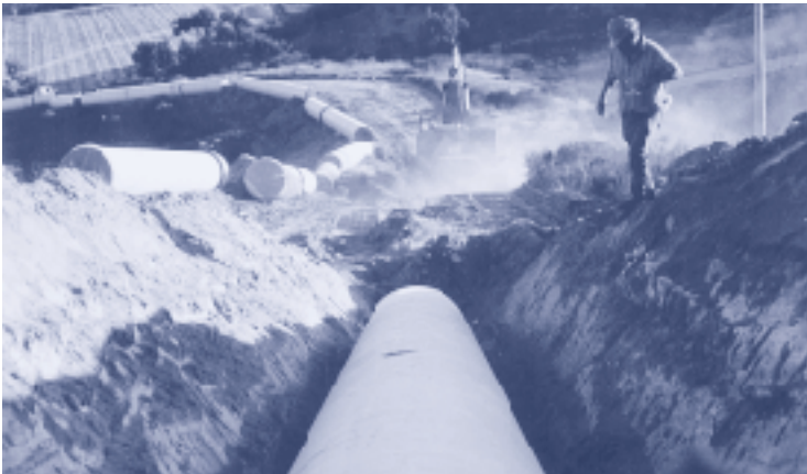
Over the next 10 years, Goleta Water District plans to complete over $20 million in maintenance and upgrades to pumps, pipelines, wells, the treatment plant and other infrastructure to ensure a water system that is reliable and provides high quality service to customers.

The treatment plant, reservoirs, pipelines, pumps and wells that supply your water require major investments for the physical facilities themselves. Our job is to manage the finances as efficiently as we manage the water system.